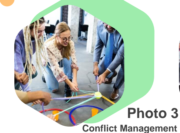
(5 construction simulation games)